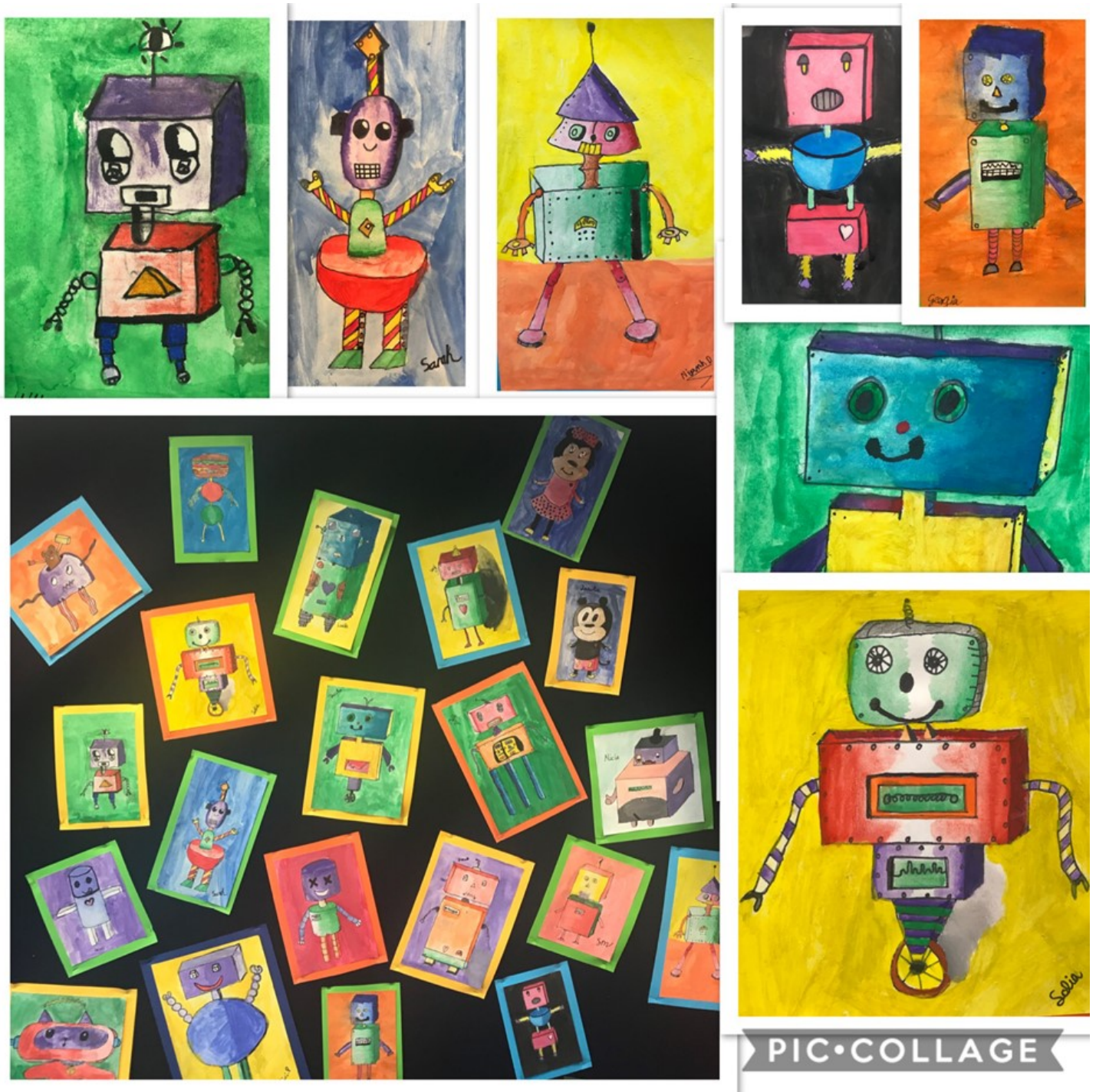
Room 4's 3D robots in watercolour.